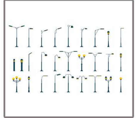
Customized Lighting Poles