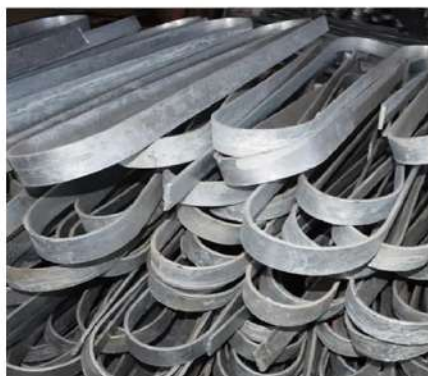
GI Earth Strips