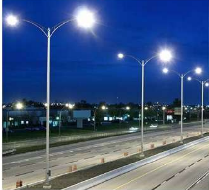
Octogonal & Conical Street Light Poles