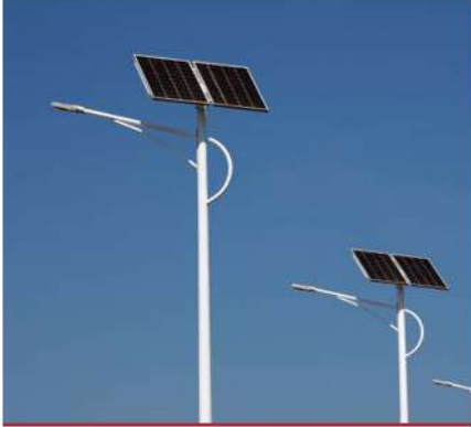
Solar Street Light Poles